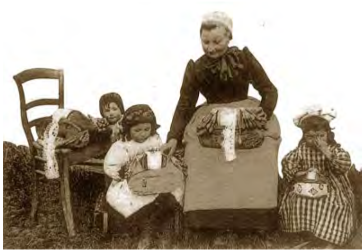
Two industries that have come and gone in Eynesbury -

Above - Making lace in the 19 th century in Back Street